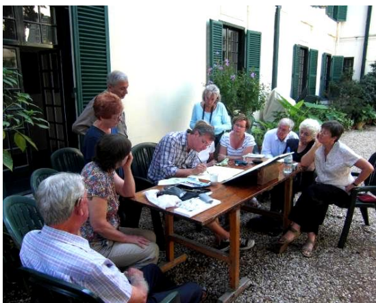
Demonstrating in the courtyard of the British School at Rome

Staying at the British School at Rome for the visit will give a relaxed, informal feel to the trip with the benefits of joining fellow residents for dinner in the evenings, making use of the school's extensive library, attending informal lectures and looking at rare items from the school's collection of antiquarian books.