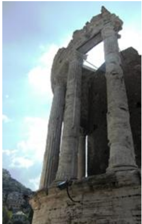
A view of the Temple of Vesta, Tivoli