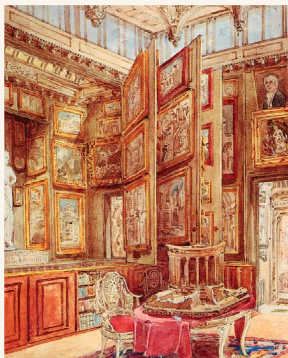
The Picture Room, 1825