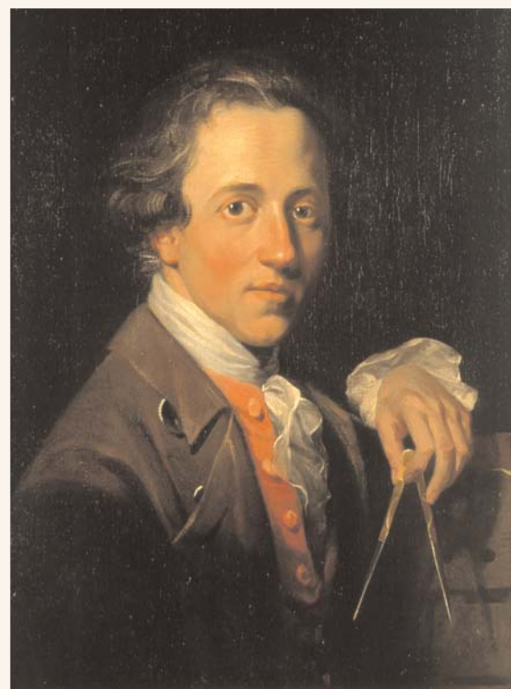
Portrait of John Soane by C. W. Hunneman, 1776

'Sir John Soane was one of England's finest architects and the Museum at Lincoln's Inn Fields . . . an internationally recognised treasure' Sir Norman Foster