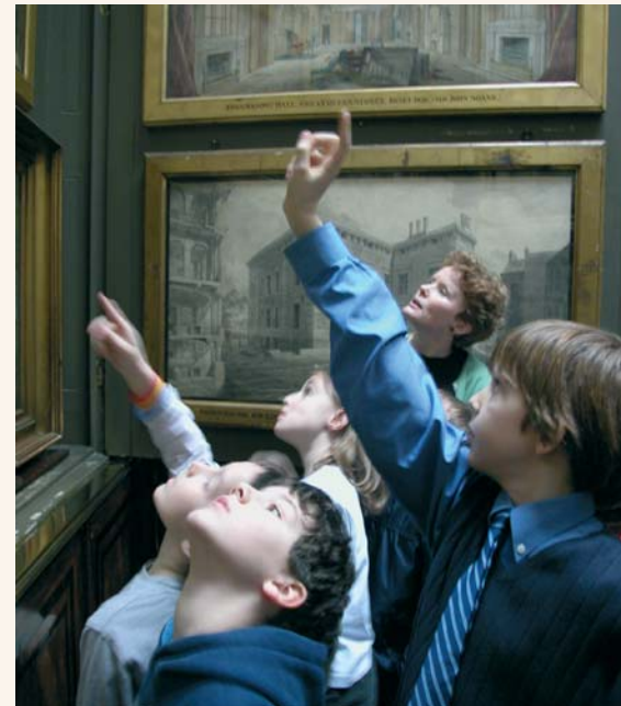
Year 5 students in the Picture Room in No.13 Lincoln's Inn Fields

Your support will allow us to develop our education programme and help to ensure that education remains a core activity of the Museum.